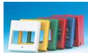
RANGE OF CASING COLOURS White, Yellow, Green, Red, Blue